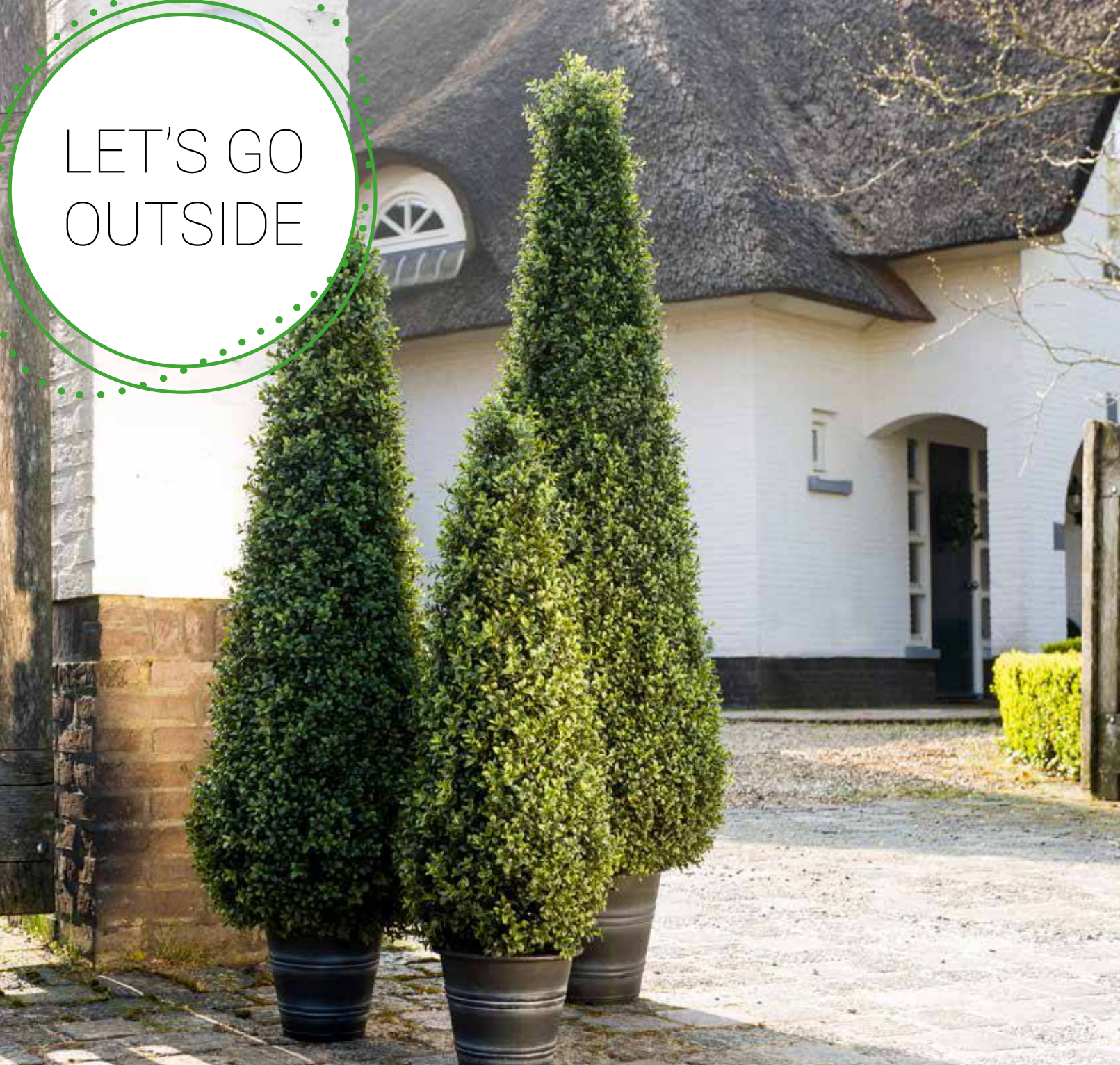
Boxwood Pyramid in pot.

So easy to maintain! Simply put the balls in a trendy pot to create a fantastic, eye-catching display for your garden or balcony.