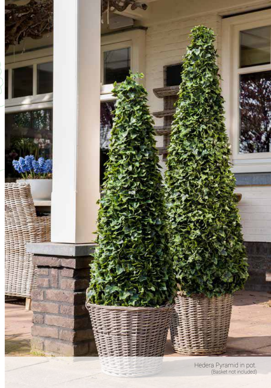
Hedera Pyramid in pot. (Basket not included)