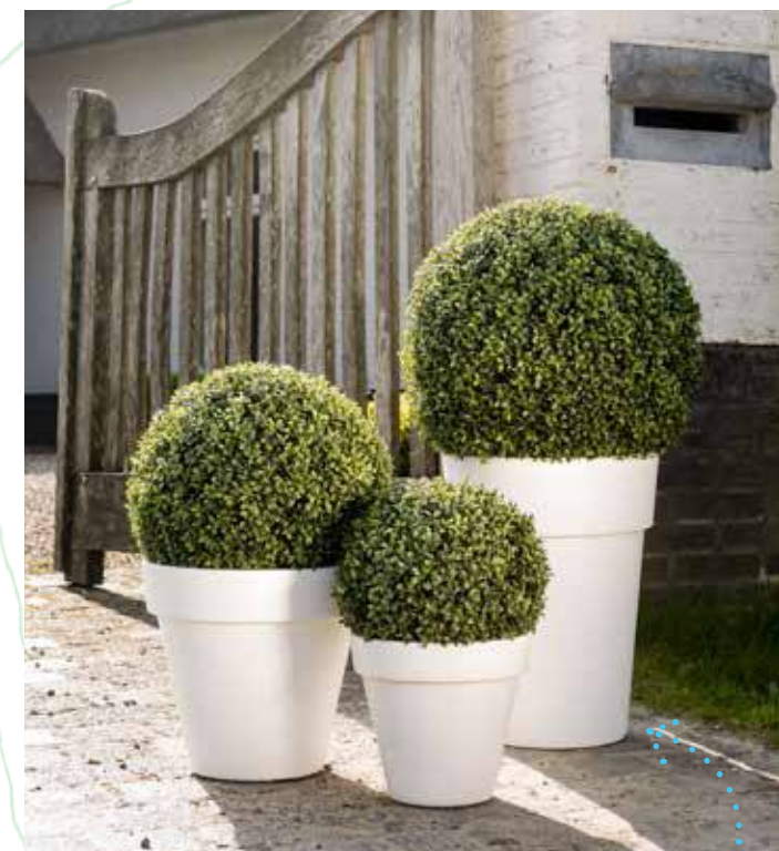
Boxwood balls. (Pots not included)